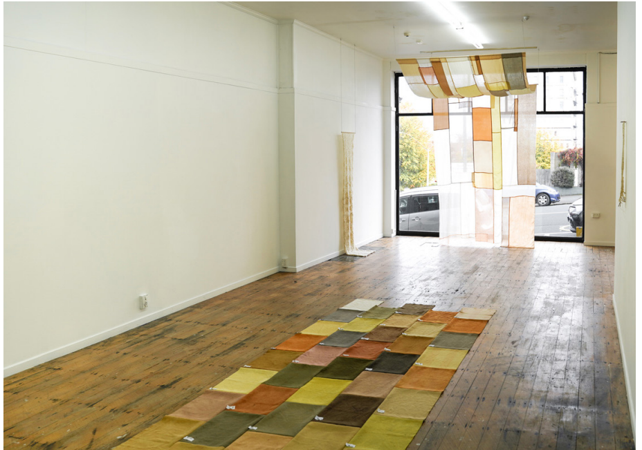
Gallery One: Arielle Walker, Distance reworked from the roots to the stem, 2021.

Both galleries have fluorescent lighting in fixed positions. Please download the Floor Plan from the Blue Oyster website.