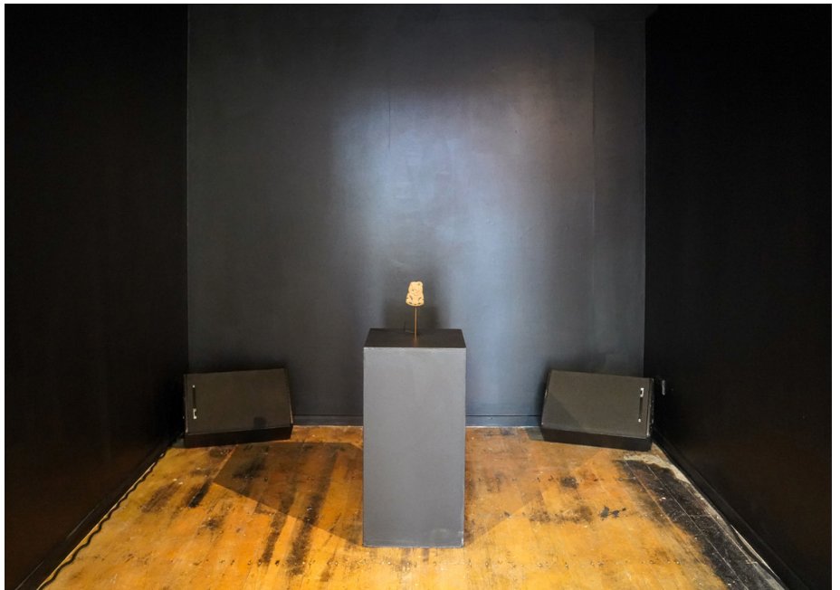
Gallery Two: Turumeke Harrington, SPECIAL TIME (Ehara i te ti) , 2021.