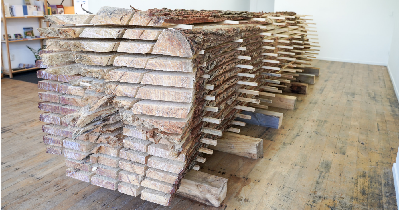
Image: Miranda Bellamy & Amanda Fauteux, radiata , 2021.