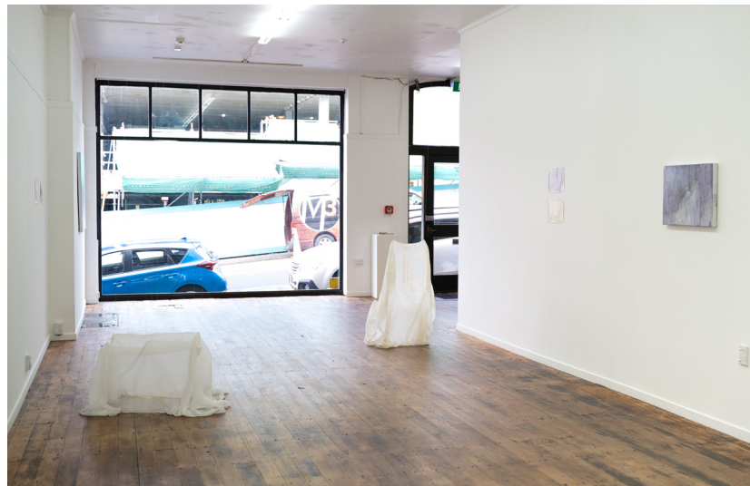
Stacy Cooper & Ava Trevella, Whorl , 2024

Please download the floor plan from the Blue Oyster website for a detailed outline of the gallery space.