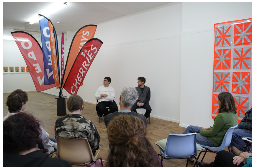
Artist talk with Jimmy Ma'ia'i for 4 HIRE , 2024