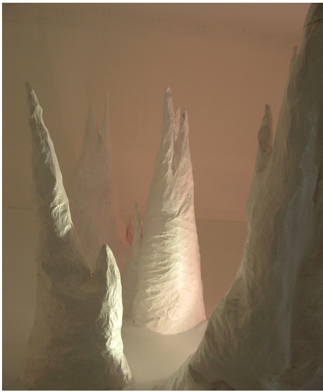
Left: Anya Sinclair Future Girl (2009) paper mache, wire, acrylic and glitter